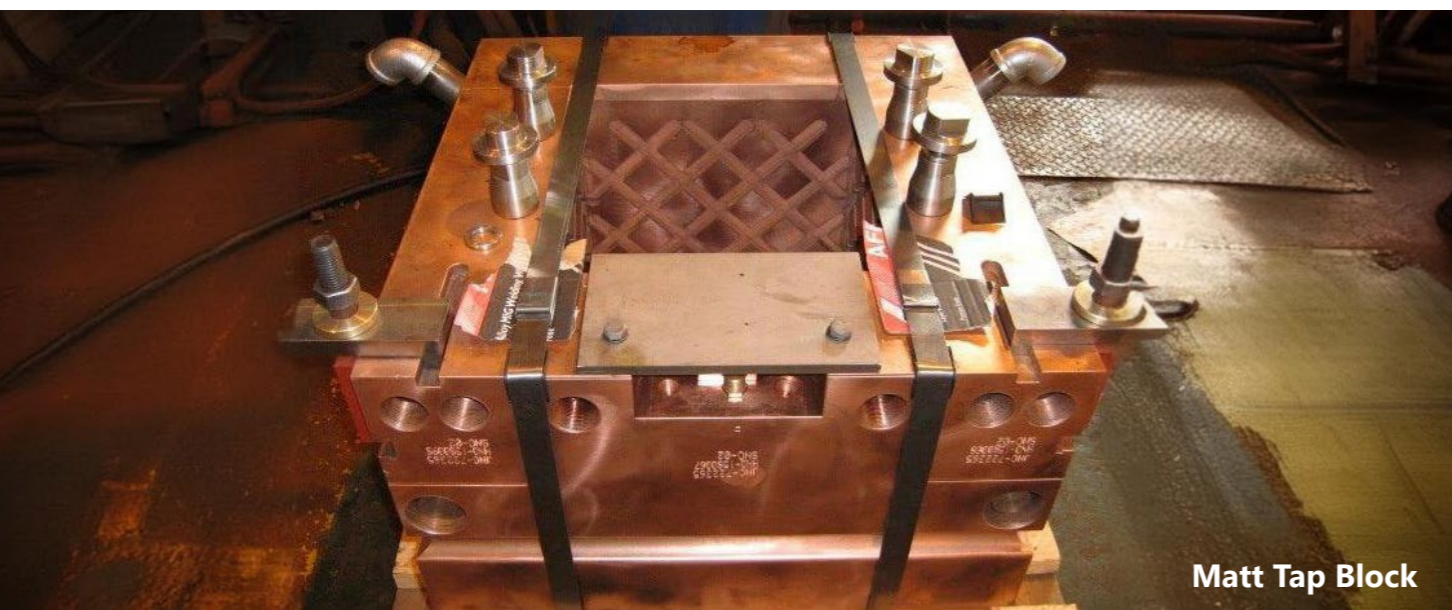
Matt Tap Block